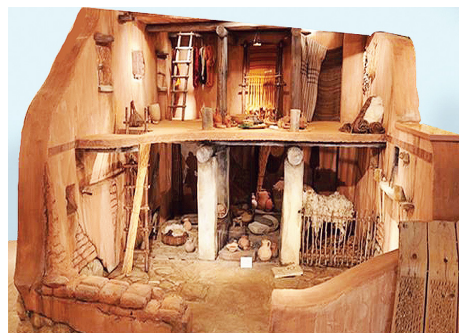
Typical home in Bible times. Jesus, was in the “animal garage manger.”

As most of you know, or might have not considered, there is no innkeeper mentioned in the Biblical story of Christ’s birth. But there was in the Good Samaritan story.